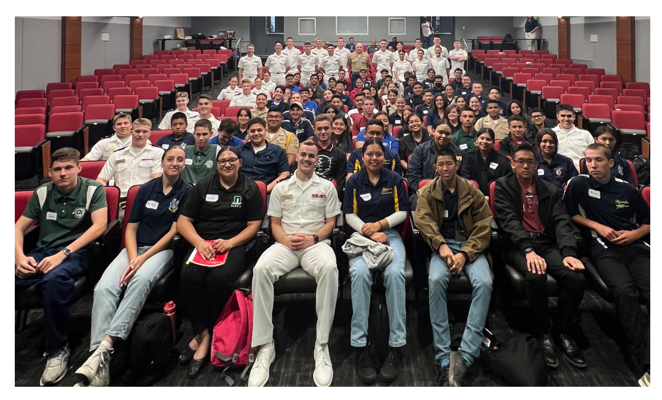
First Annual JROTC Symposium Spring 2023

This spring, our unit is gearing up for the second annual JROTC symposium scheduled for February 24th. With the insights gained from our previous event, we are confident this will be another outstanding occasion.