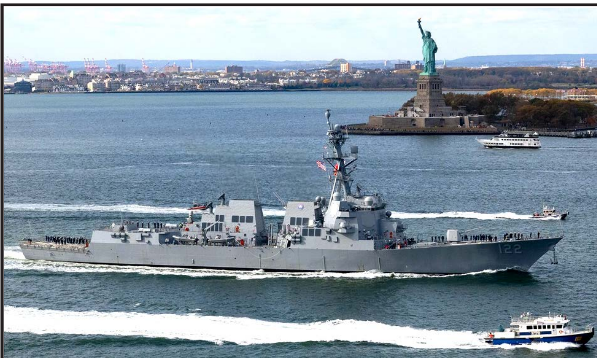
USS John Basilone (DDG-122)

The ship is the second named for GySgt Basilone. The first ship was DD-824, a Gearing-class destroyer commissioned in 1949 and decommissioned in 1977. USS Basilone (DDG-122) joins the fleet as part of the Navy's surface warfare backbone, equipped with dual helicopter hangars and advanced capabilities for anti-submarine, anti-surface and anti-air warfare operations. After the commissioning, the warship departed for its home port assignment at Naval Station Mayport, Florida.