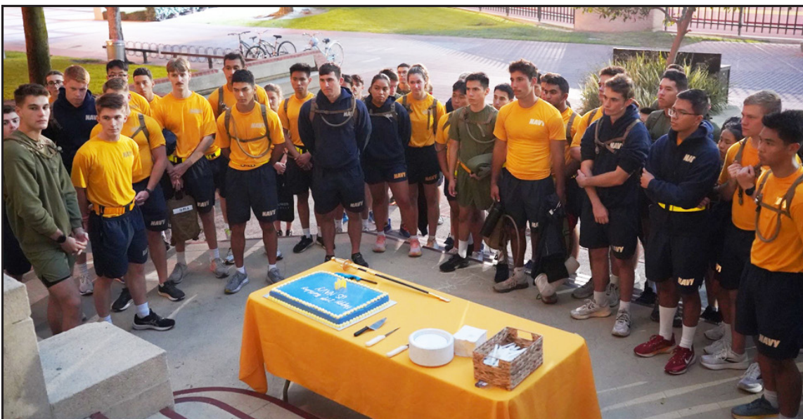
Happy 249th Birthday to the NAVY!