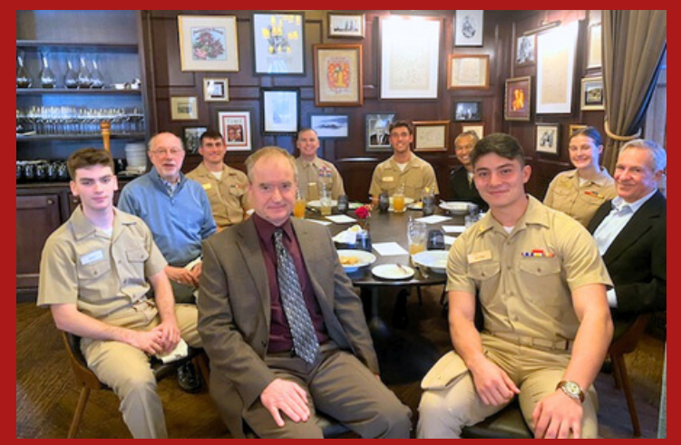
Lunch with the Alumni League