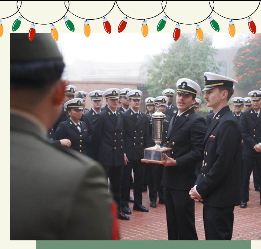
Operations Platoon's Leadership recieving the trophy

Operations Platoon's success was not limited to individual events but was the result of consistent effort, team work, and camaraderie among all platoon members. While Operations Platoon secured the Golden Canteen, the competition was a collective effort that showcased the talents and dedication of the entire Battalion. Training Platoon and Communications Platoon demonstrated exceptional performances across various events, contributing to the spirit of friendly rivalry that is part of what defines the Trojan Battalion. The Golden Canteen competition is more than a contest; it's an opportunity for midshipmen to build camaraderie and embody the values of discipline and teamwork that are central to the NROTC program and the Naval Service. Congratulations to Operations Platoon on their well-earned victory, and Bravo Zulu to all platoons for their hard work and completion of another successful semester!