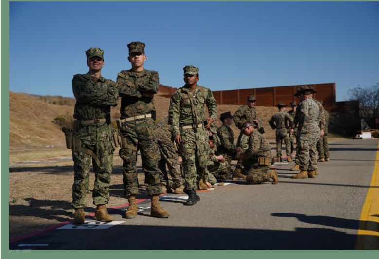
MIDN reloading their weapons