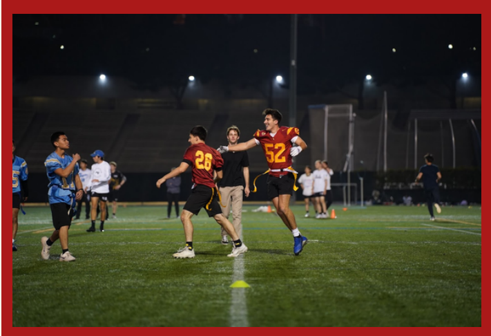
MIDN Giorgetta facing off against UCLA