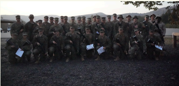
The team stands accomplished after the final awards ceremony.