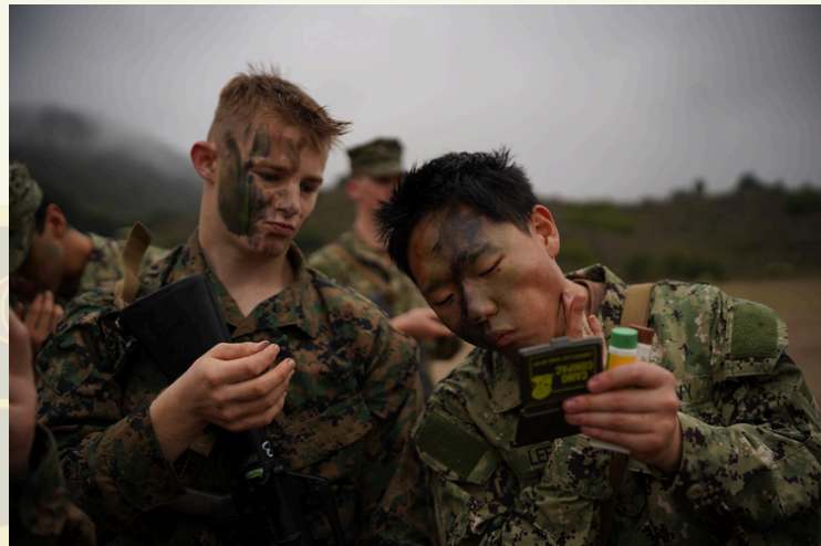
MIDN 4/C Turk and MIDN 4/C Lee apply camouflage paint to blend in with their surroundings.

At the completion of SULEs, the final evaluated event was day land navigation. Evaluators provided each MIDN with a starting point and five 8-digit grid coordinates, the last being the LZ. Everyone had 2 hours to plot and maneuver their route. One of the most complex parts was navigating the rugged terrain, including steep hills, ditches and draws, creeks, and dense vegetation. The points were spread out, with some 2000+ meters apart, so it was essential to come up with good routes to hit all the points. Like night land navigation, Midshipmen were scored based on the accuracy of plots and finding the correct points.