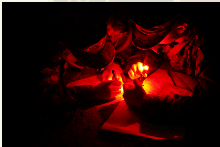
MIDN 4/C Zhang and MIDN 3/C Banks working together to plot their points.