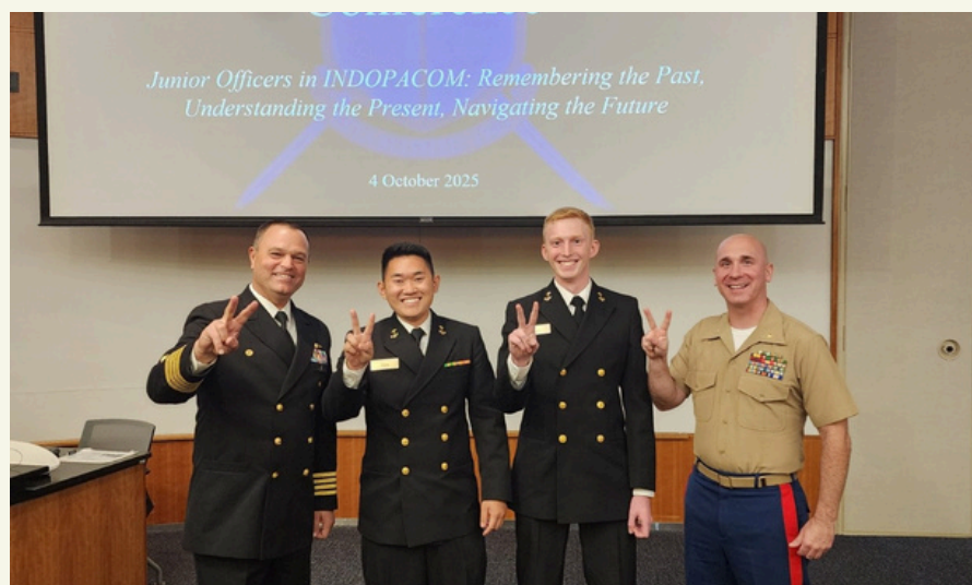
USC MIDN with Duke's CO and XO.