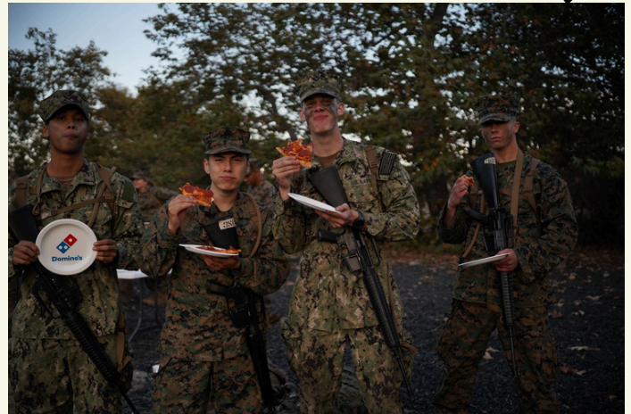
MIDN enjoy a "Warriors Dinner" following the completion of the training evolution.