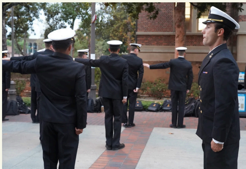
Training Platoon forms for inspection.