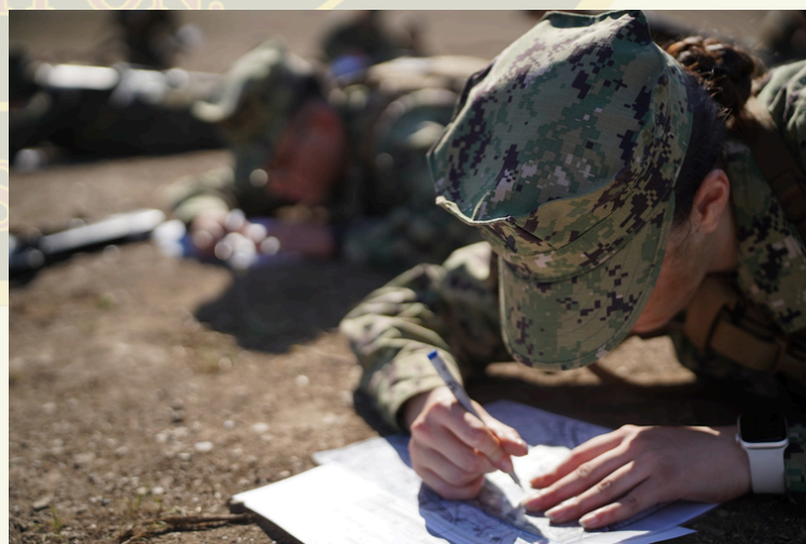
MIDN prepare their points and routes using various mapping tools.