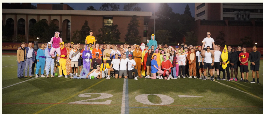
Below: 3/C and 4/C MIDN line up to square off against 1/C, 2/C, and OC/MECEPs.