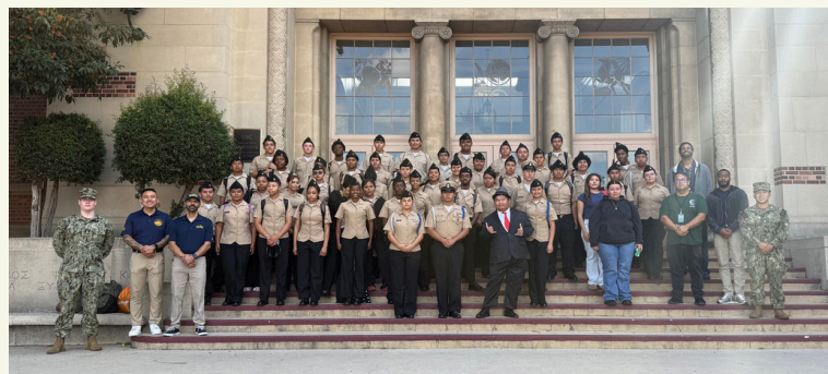
The NJROTC cadets of Narbonne.

On October 23rd, the Trojan Battalion had an opportunity to host Narbonne High School at the University of Southern California. The Narbonne cadets had the opportunity to learn how to apply for the NROTC scholarship, explore Midshipman life, and tour the USC campus. The Battalion looks forward to hosting more NROTC cadets during the upcoming JROTC symposium in November.