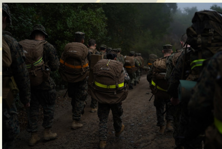
The team hikes through the hills of Camp Pendleton.