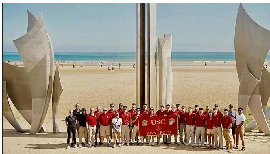
NROTC midshipmen and faculty on Omaha Beach in front of the "Les Braves" memorial sculpture