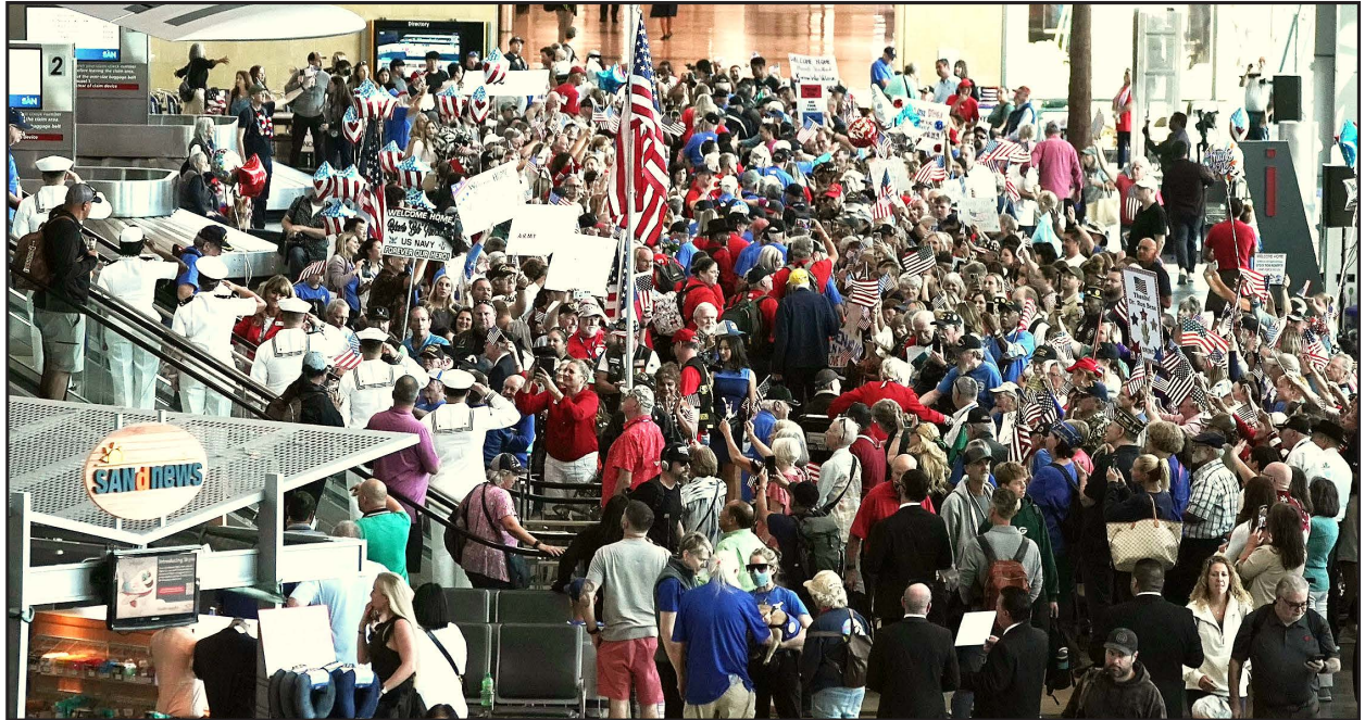
Homecoming in San Diego

Honor Flight shows gratitude through action - to display to our veterans the appreciation and honor they de-serve. To find out more about Honor Flight, access the website at: honorflight.org . Korean and Vietnam veterans that are interested in Honor Flight can search on the website for Honor Flight "hubs" (over 128) that may be near them.