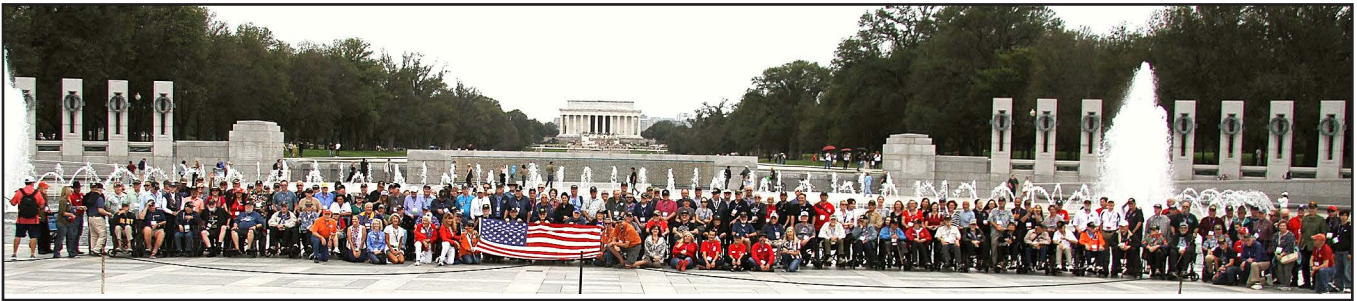
Over 200 Vets and volunteer “guardians” at the WWII Memorial

Our Friday flight flew to Baltimore, MD where we stayed at an airport hotel. Up early on Saturday and after breakfast we bused into Washington for a day of sightseeing. We started at Arlington National cemetery, where we watched the changing of the guard and viewed the massive cemetery grounds. Next, we visited the Marine Corps Memorial, the Air Force Memorial, and drove by the Pentagon and the Lincoln Memorial, followed by a visit to the Vietnam Wall Memorial, where I was able to see some names of friends and ship-mates who lost their lives. We also saw the Korean War Memorial, the Nurses Memorial, the FDR Memorial and the Navy Memorial. We ended the day seeing the World War II Memorial, and then it was back to our Baltimore hotel for a dinner honoring all of the veterans.