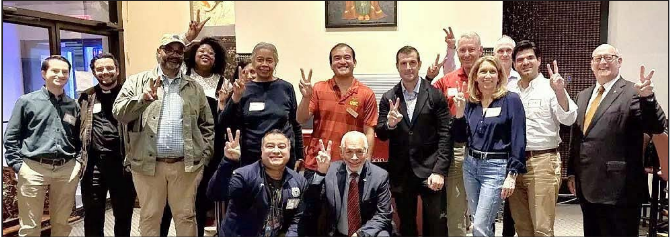
USC NROTC Alumni League and USC Alumni Veterans Network members