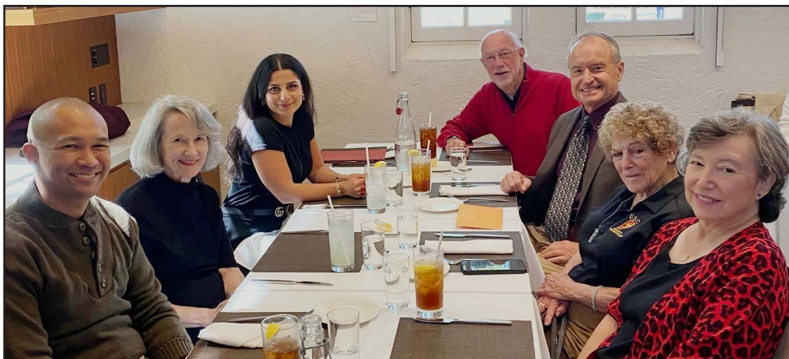
Farewell Luncheon at the University Club