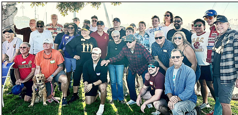
Group photo of participants and NYCLB members at the 9 November event