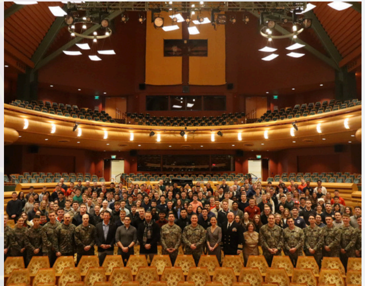
A group picture of all conference attendees